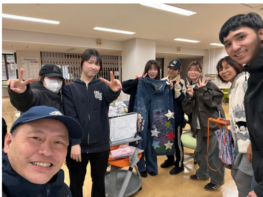
PMPG Church Team at Osaka University Prayer Walk:

We praise God that the Holy Spirit moved in the hearts of several students, many of whom had never heard about Jesus before. One particular student was even moved to tears during prayer.